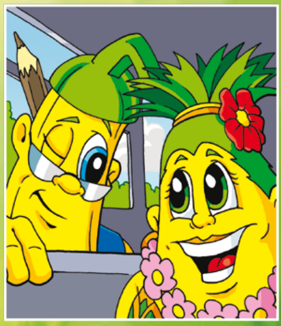
Everyone jumped back on the bus and they set off again. They didn't see Bad Apple behind them...

the map and dug up the treasure ourselves? he asked.