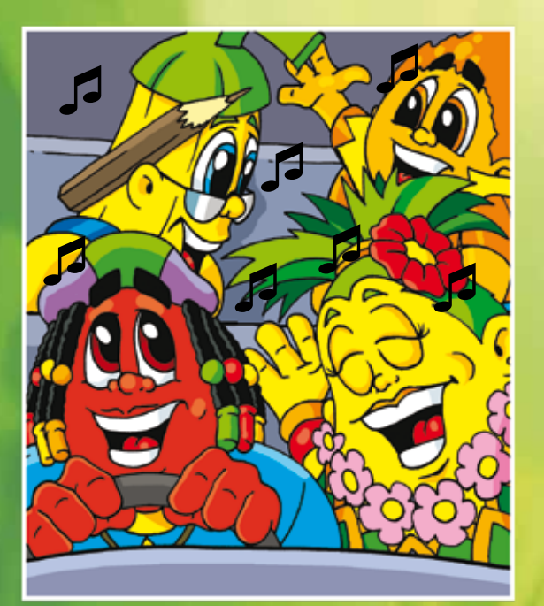
Back on the bus, the friends were singing along to some of their favourite songs on the radio.