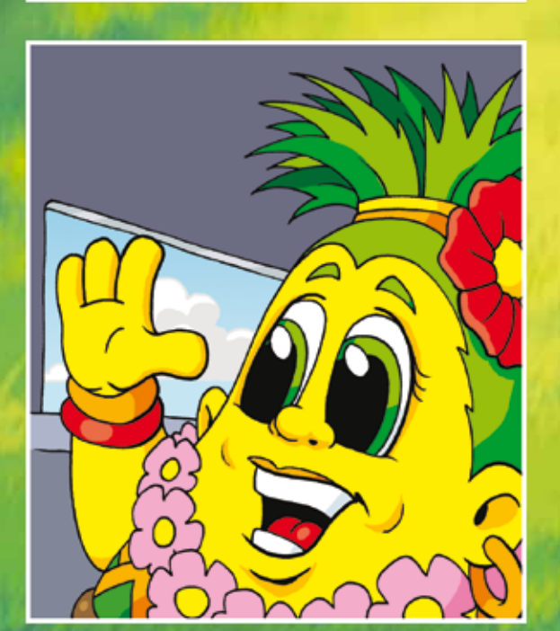
Su Su was worried. The carnival would be starting soon, and there was no sign of the treasure.