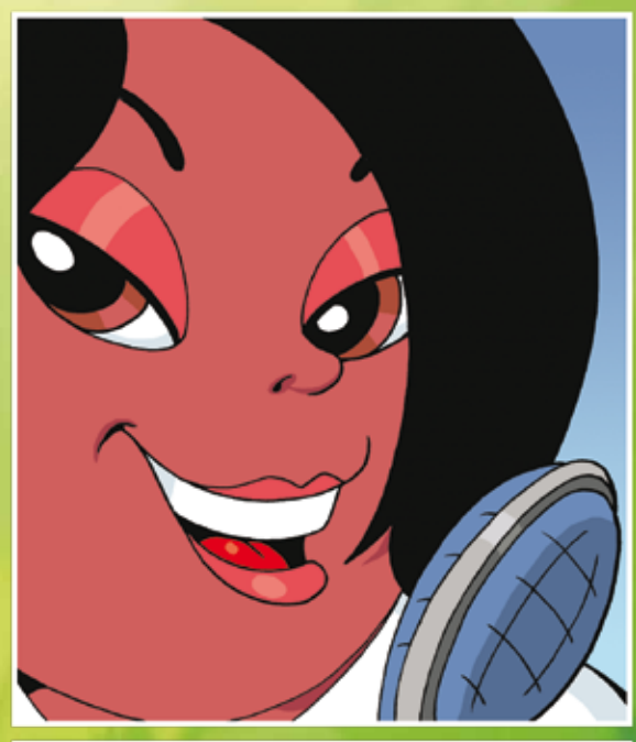
Penny Passion Fruit was playing special carnival music on Tropical Island Radio.