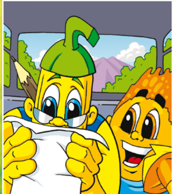
"We're almost there," said Bernie, looking at the map. "We just have to cross the river!"