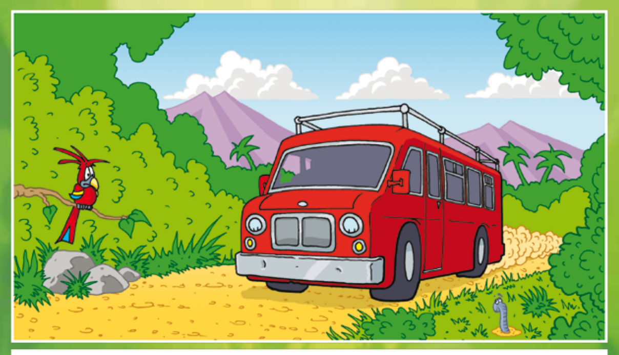
The Sugar Canes climbed aboard the bus and Monty set off once again. They hoped it wouldn't take long to find the treasure as they wanted to get to the carnival! They didn't want to miss the Limbo dancing!