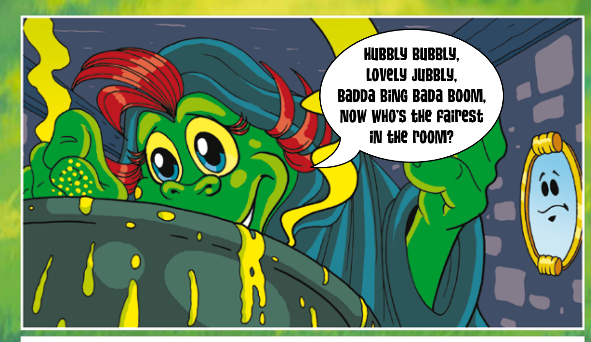
Meanwhile, Lizzie the Lizard, Tropical Island's witch, was casting a magical spell, Lizzie lived alone in the swamp. All she wanted was for people to like her.