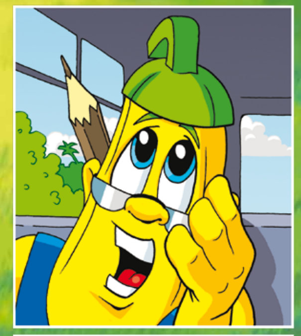
Bernie sighed. Would Oliver ever learn to keep a secret?

As Monty drove his bus along, he spotted The Sugar Canes. They were the best band on the island!